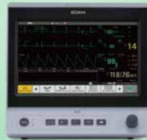
X10 Patient Monitor