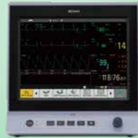
X series Patient Monitor