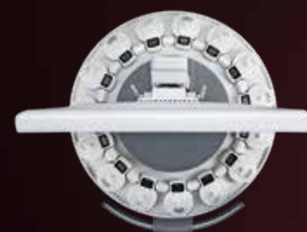
FTS-6 Central Monitoring System