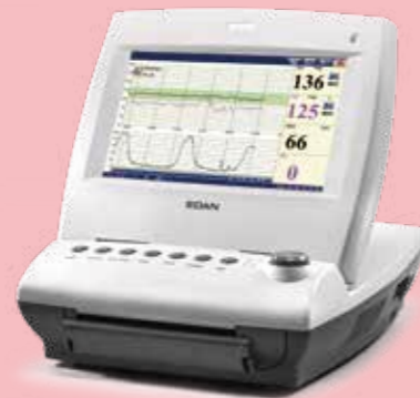
F6 Fetal & Maternal Monitor