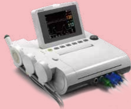
F3 Fetal Monitor