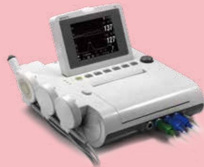
F2 Fetal Monitor