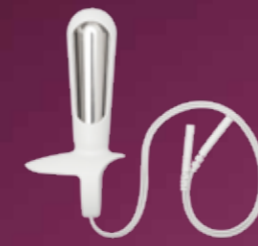
SV1/SV2 (Reusable/Disposable vaginal EMG /Stimulation sensor)