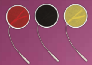
Adhesive sensor (Disposable skin surface EMG/ Stimulation sensor)