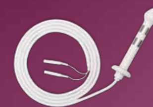
SA (Reusable rectal EMG/ Stimulation sensor)