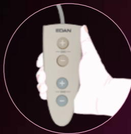
Remote intensity control