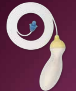
Vaginal Stress Probe