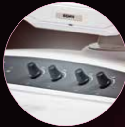
Current control knob